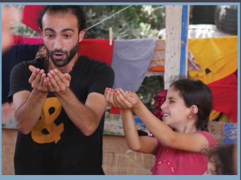
Sounds of Change

City of London Sinfonia (UK) MitMachMusik (Germany) Music as Therapy International (UK) Sanitansamble (Italy) SONG Onlus – Sistema Lombardia (Italy)