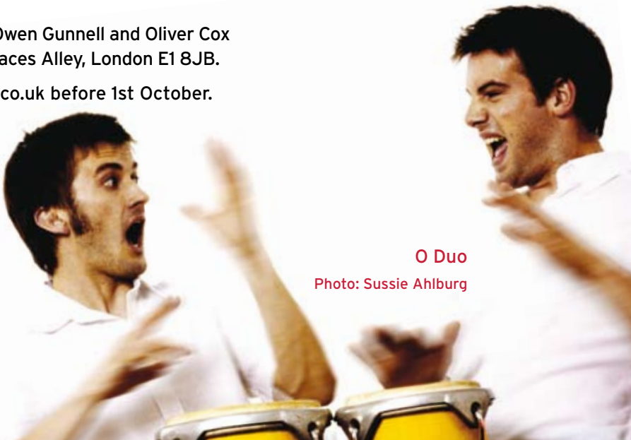
O Duo

For invitation email susanrivers@bbtrust.com